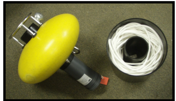
Ellipsoid Float on Release Canister with rope